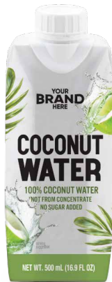
500mL Coconut Water