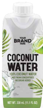
330mL Coconut Water