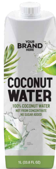
1000mL Coconut Water