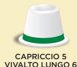
CAPRICCIO 5 VIVALTO LUNGO 6