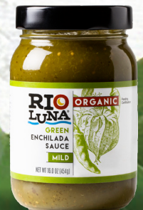
16 oz. Organic Green Enchilada Sauce

Drive incremental category growth with the #1 brand of organic peppers nationally