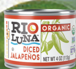
4 oz. Organic Diced Jalapeños