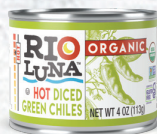
4 oz. Organic Hot Diced Green Chiles