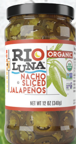
12 oz. Organic Nacho Sliced Jalapeños