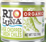
7 oz. Organic Large Chopped Green Chiles