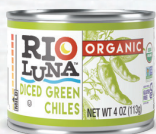
4 oz. Organic Diced Green Chiles