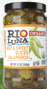
12 oz. Organic Hot & Sweet Sliced Jalapeños