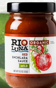
16 oz. Organic Red Enchilada Sauce